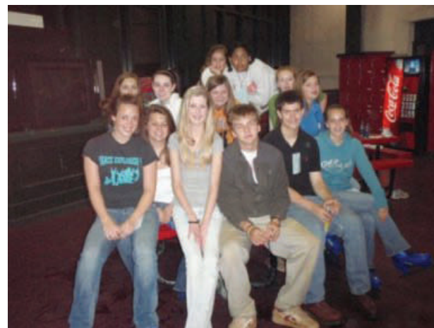
The group that went skating in May

Several of our youth are joining youth from St. Thomas Episcopal Church (15 youth and adults) for a mission trip to Richwood, West Virginia. They will depart on Sunday, July 6. While in Richwood they will be doing minor home repairs, carpentry and painting. Please pray for their safety and their growth in Christ as they serve others. The theme of their mission trip is "Love Out Loud" . Your donations to the yard sale mentioned in the Missions section will help the youth cover their expenses.